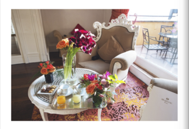
Opulance and confort are not confined to the hotel's public areas alone. Rooms and suites show a gentle use of lines and almost imperceptible curves, creating a perfect blend of innovative setup style, combined with classic elegance. Simple dedoc and modern controlled add to the hotel a warn and inviting feel, introducing contemporary aspects into traditional style.