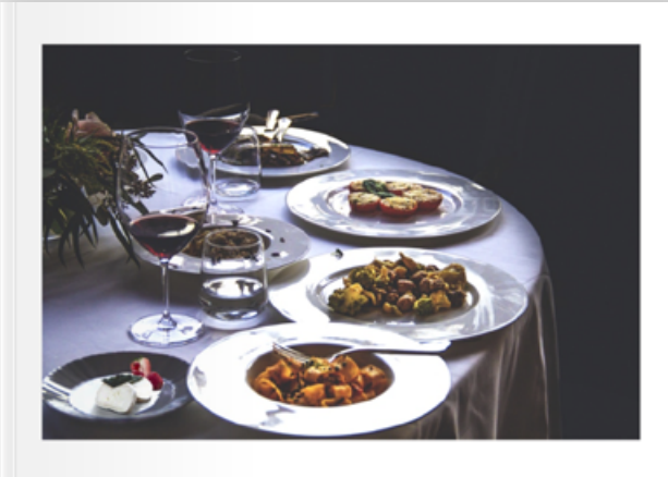
Hotel Majestic Roma